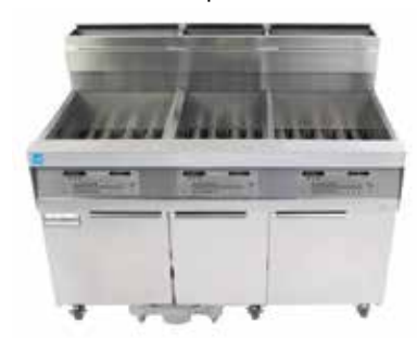
Model Shown: 11814/HD50G/11814