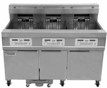
Model Shown: 11814E/RE17/11814E