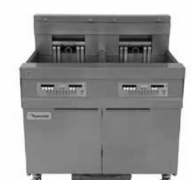
Model Shown: 21814E with optional filtration